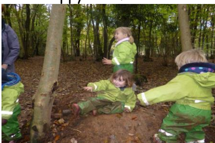
Happy and Fun